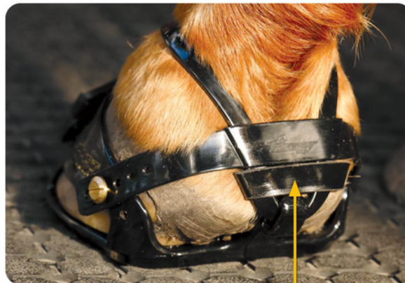
Bulb Strap Extender

If the Bulb Strap is sitting too low you can either try the medium Bulb Strap (included in the accessories bag), or it can be lifted higher by inserting the Bulb Strap Extender.